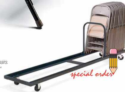
HCT8 Holds 42 folding chairs. 100" x 21" x 38 1/4" Special Order List $525 $348